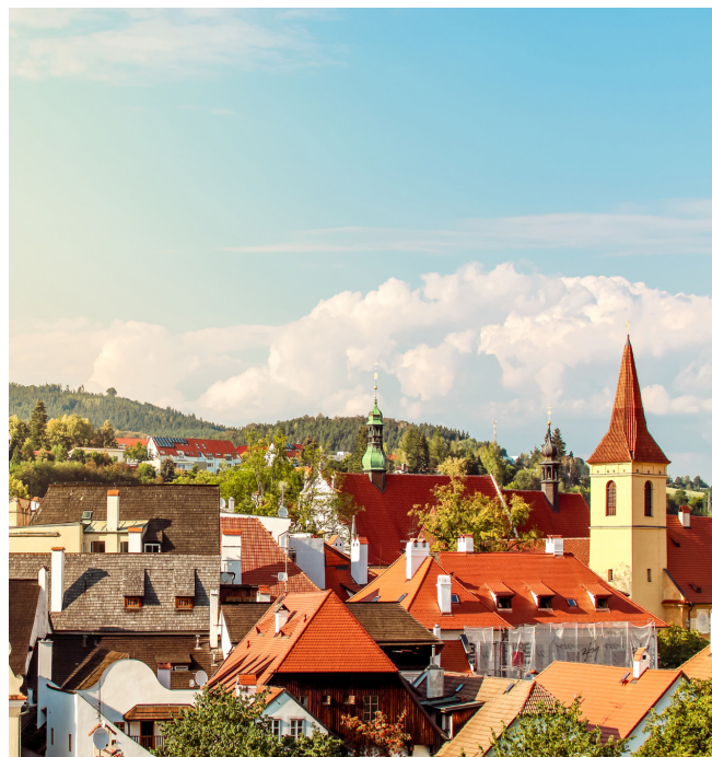
*Český Krumlov, Czechia

PRICING per person $7,379 double | $8,389 single