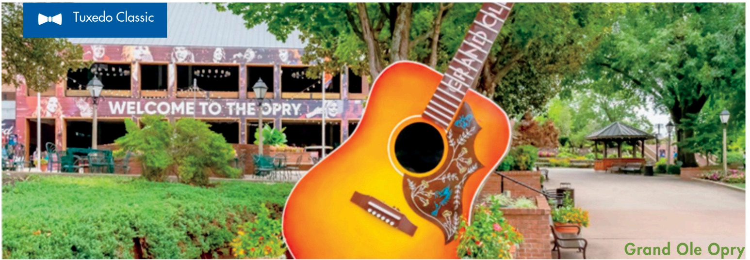
Grand Ole Opry