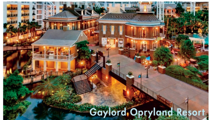
Gaylord Opryland Resort

How to book: Reservations may be made through any CAA Niagara office with a travel agent. A non-refundable deposit of $300 per person is due at time of booking. Balance of payment is due, August 20, 2025. CAA strongly recommends the purchase of travel insurance. Ask for details.