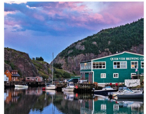
Quidi Vidi, Newfoundland

Today we will go "around the Bay" along the picturesque coastline of Conception Bay, the home of pirates of centuries ago. Stops will be made along the way for picture taking and to visit some of the more interesting villages such as Holyrood and Brigus. Brigus is one of the historic sailing ports of Conception Bay and home of the late, famous Captain Bob Bartlett who took Perry to the North Pole.