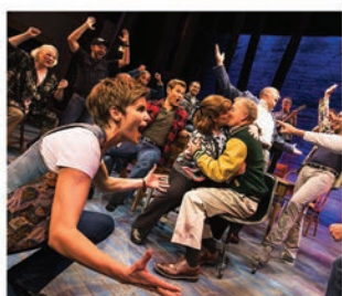
Come From Away