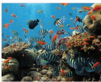
Ripley's Aquarium of Canada