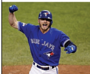
Toronto Blue Jays