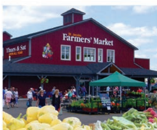
St. Jacobs Farmers' Market

We have a spectacular lineup of day tours planned for 2018. From theatre productions to sporting events and more, there's sure to be something for everyone.