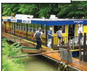
Grand River Cruise

For a list of 2018 Day Tours, visit caaniagara.ca/tuxedotours , call 905-322-2712 or visit your local CAA Niagara Branch.