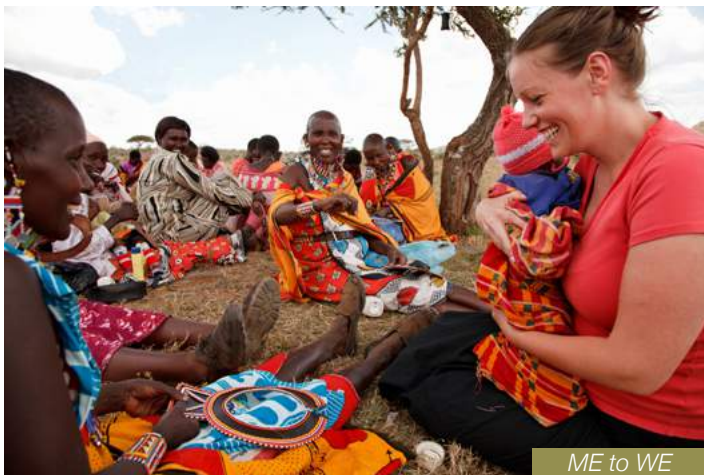
ME to WE

DAY 9 - Maasai Mara/Ngerende/Bogani After breakfast, depart to Bogani Cottages and Tented Camp. On arrival you will meet your Lion World Travel/ME to WE representative at the Ngerende Airstrip and transfer to Bogani. Bogani offers a completely different experience compared to Kenya's safari camps by providing a genuine opportunity to get involved with the local community. Bogani is located to the north of the Maasai Mara, surrounded by open countryside and local villages. There are five large family cottages and 18 safari tents, all surrounded by open countryside.