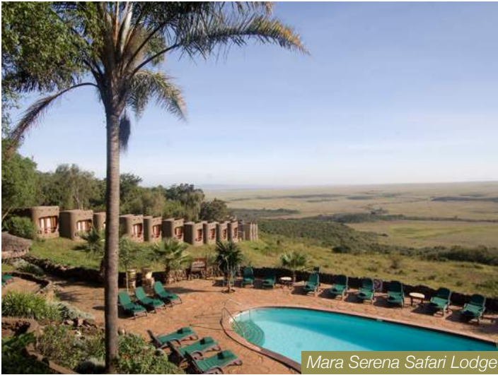
Mara Serena Safari Lodge

well as many others. The Mara is also notable for its abundance of lions, especially the superb black-maned males. After lunch, enjoy an afternoon safari game drive.