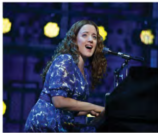
Beautiful: The Carole King Musical