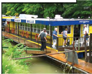
Grand River Cruise

For a list of 2017 Day Tours, visit caaniagara.ca/tuxedotours or stop by a CAA Niagara Branch