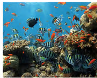
Ripley's Aquarium of Canada