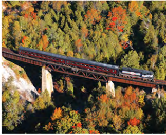
Credit Valley Train Tour

We have a spectacular lineup of day tours planned for 2017. From theatre productions to sporting events and more, there's sure to be something for everyone.