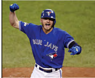
Toronto Blue Jays