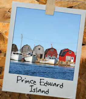
Prince Edward Island